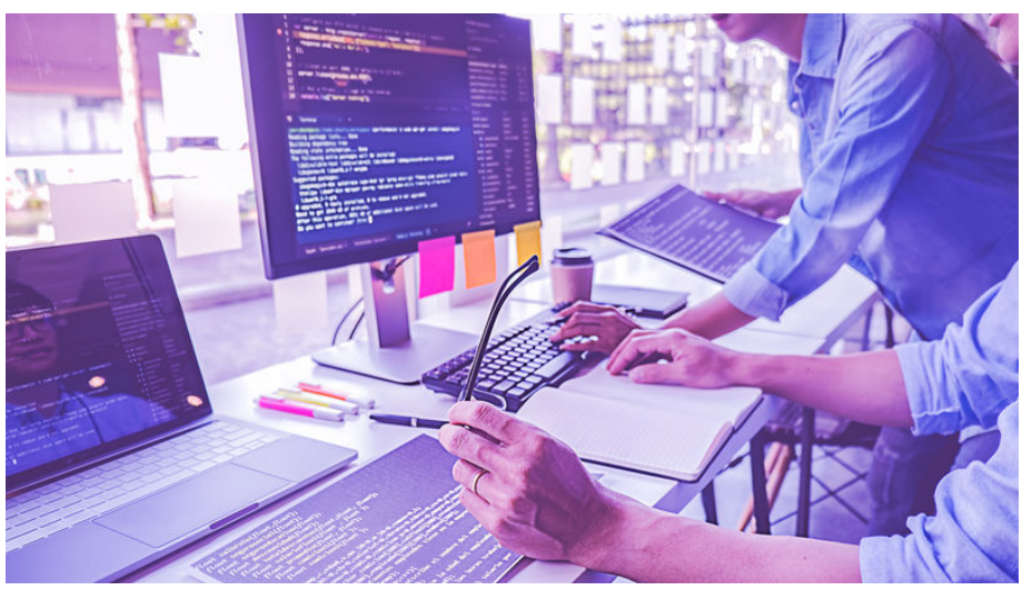
High-Performance VPN Tunnel Termination

The Extreme Tunnel Concentrator is designed to simplify tunnel termination and is a key component of Extreme's branch solution. The application is part of the ExtremeCloud portfolio of applications and is deployed on the ExtremeCloud Edge platform. Extreme Tunnel Concentrator provides scalable, enterprise-class GRE/ IPSec* tunnel termination for thousands of Layer 2 GRE/IPSec tunnels from remote access locations.