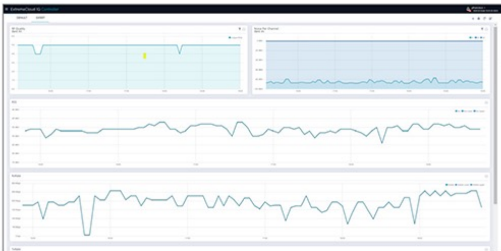
Figure 2: Expert Views of the RF State

One of the key characteristics in providing a more intuitive management experience is visualization of the RF performance at each managed site. The ExtremeCloud IQ Controller helps users understand the detailed performance of Wi-Fi by providing Expert Views of the RF State, including: RxRate, TxRates, RSS, WirelessRTT, and NetworkRTT. The unique RF Quality Indicator (RFQI) assigns a multi-dimensional score to indicate how well a particular AP is serving its associated clients and paints it over the AP's coverage area. Planning views are also available to help users understand the channel plan and the live RF coverage across a floor plan. Support for management of IoT functions, such as BLE and beacon detection or transmission, are also supported for use cases of client location and asset tracking.